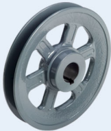
Finished Bore AK/BK