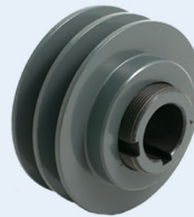
Variable Pitch 2VP

Sheaves are commonly used in a wide range of applications including: