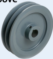
Finished Bore 2AK/BK