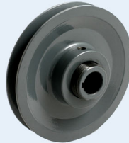
Variable Pitch 1VP