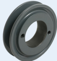
Taper Bushed AK/BK..H